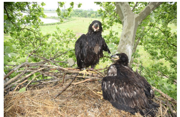
Eaglets at Masonville Cove

"I [liked] learning about the animals and trees that are found at Masonville Cove."