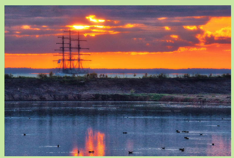
Sunrise at Swan Creek. Photo by birder Wendy Crowe during a bird walk led by Tim Carney (MES).