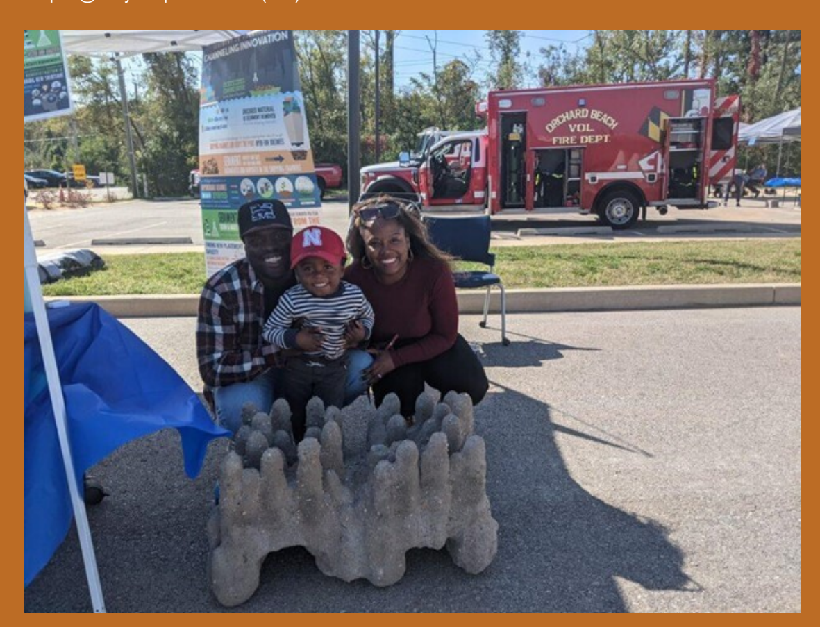
Photo: The Cox Creek DMCF Open House will include interactive, family-friendly activities such as "Touch-A-Truck," live animals, educational games, arts and crafts, and the opportunity to observe and learn about wildlife.

For more information, visit maryland-dmmp.com/cox-creek-open-house-2023 or contact ecoport@marylandports.com or (410) 385-4465.