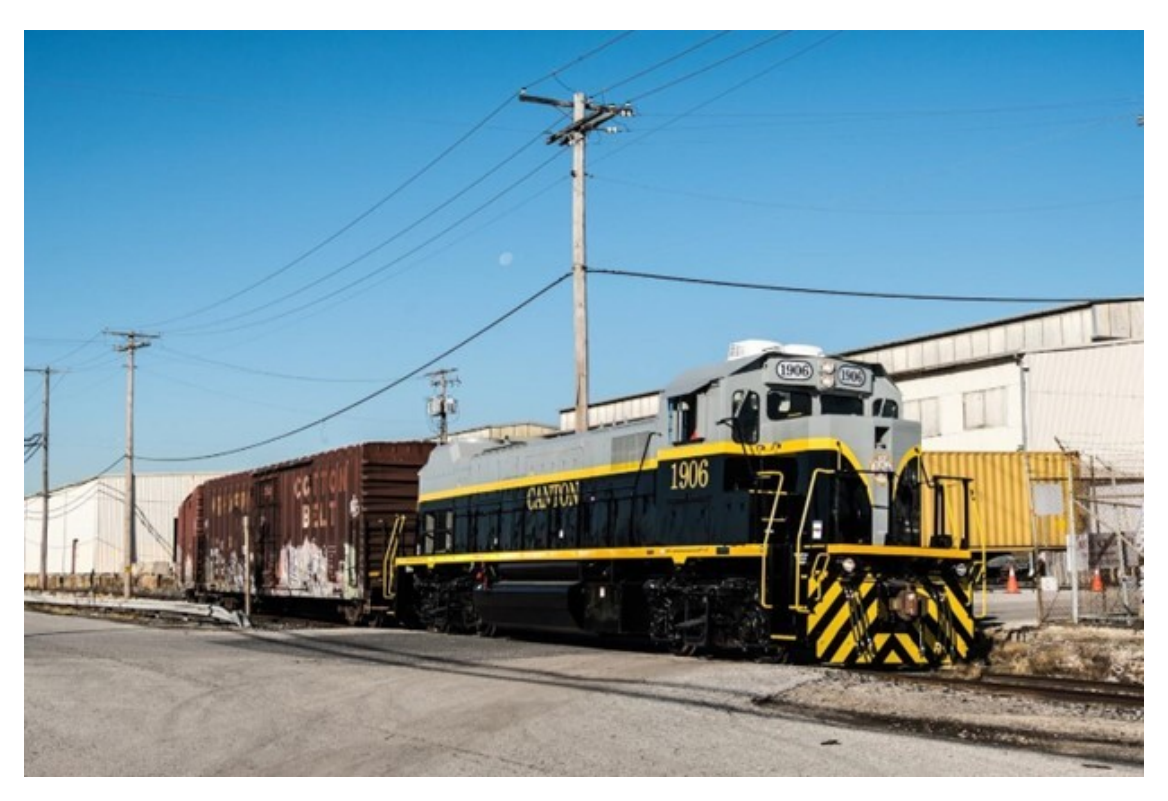
Photo : Canton Railroad's two new freight switchers will help reduce emissions in the Baltimore area.

Canton Railroad, a company solely owned by <u>Maryland Transportation Authority</u>, serves the <u>Port of Baltimore</u> and connects with <u>CSX</u> and the <u>Norfolk Southern</u> railways.