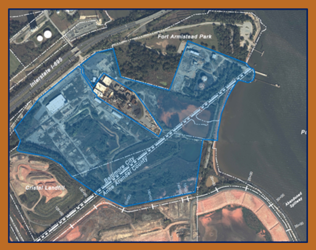
Photo: The remediation will be phased to allow incremental site development and MPA will start processing dredged material from the Cox Creek DMCF for innovative reuse starting in late 2024. Based on today's cost per cubic yard to manage dredged material, this would result in over a $200 million savings to the State over a 20-year planning horizon, far outweighing the costs of MPA participating in addressing environmental conditions on the property.

The property was part of a larger parcel of land known as the Hawkins Point Plant Site that was used for the manufacturing and packaging of titanium dioxide. Due to the presence of residual environmental contamination from industrial activity, MPA, Maryland Department of the Environment (MDE), and Tronox signed an Administrative Consent Order to ensure that the site is cleaned up and fully remediated to meet current environmental standards. Although MPA did not contribute to the environmental conditions at the property that occurred before the December 2022 purchase, the agency has agreed to help address the environmental needs along with Tronox over the next ten years, which will return the former industrial site to productive use and result in substantial long-term cost savings for the state. MPA is currently developing a master site development plan.