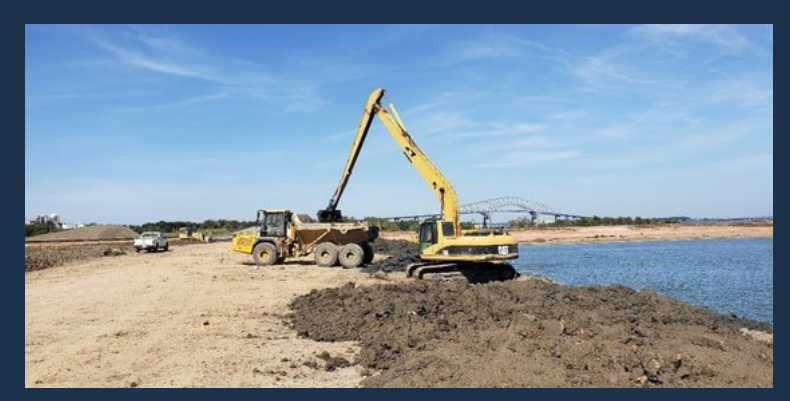
Photo: During the innovative reuse material drying operation, material excavated from the DMCF is placed on set drying pads to dry prior to stockpiling for reuse.

A minimum of six contracts will be awarded, each not to exceed $300,000. To date, ten proposals have been received.