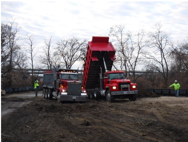
Photo: MDOT MPA is proud to partner on both the largest innovative reuse project and the largest trash wheel to date, restoring the Middle Branch for recreation and enjoyment.