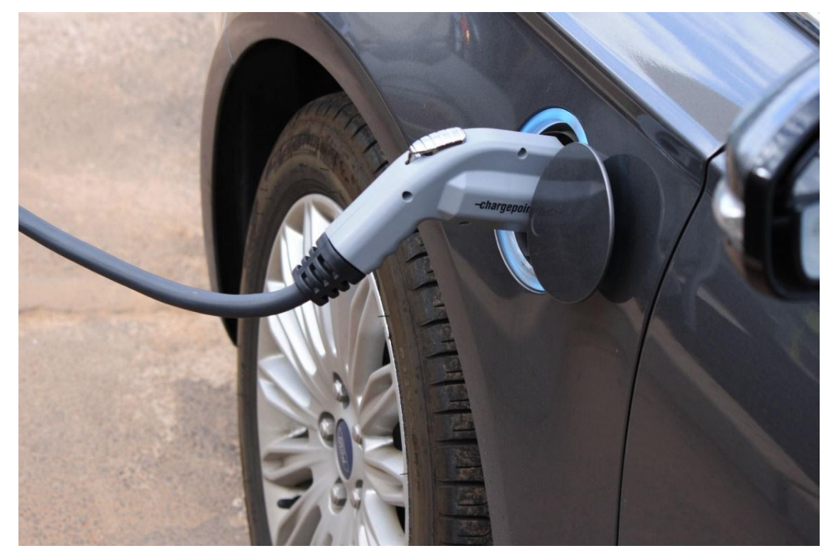
An EDF Climate Corps fellow will help MDOT MPA investigate emission reduction plans, including for the future wave of electric vehicles.