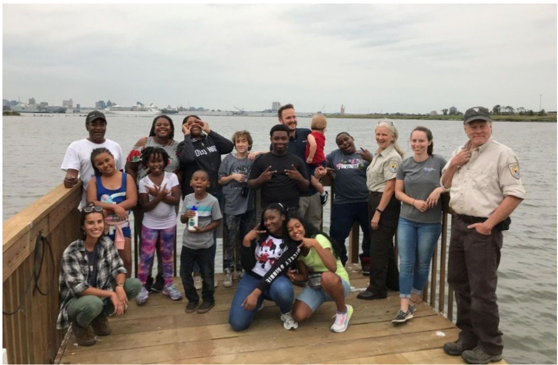
During the Decade of Dedication, partners increased neighborhood engagement and celebrated many achievements.