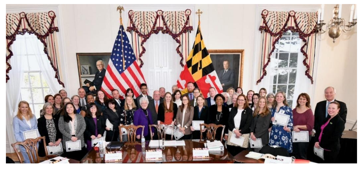
These 40 professionals are Maryland's first Certified Climate Change Professionals®. The <u>Maryland</u> <u>Climate Leadership Academy</u> was established in 2018 to specifically offer training and continuing education for state and local government officials and infrastructure professionals on the matter of climate change.