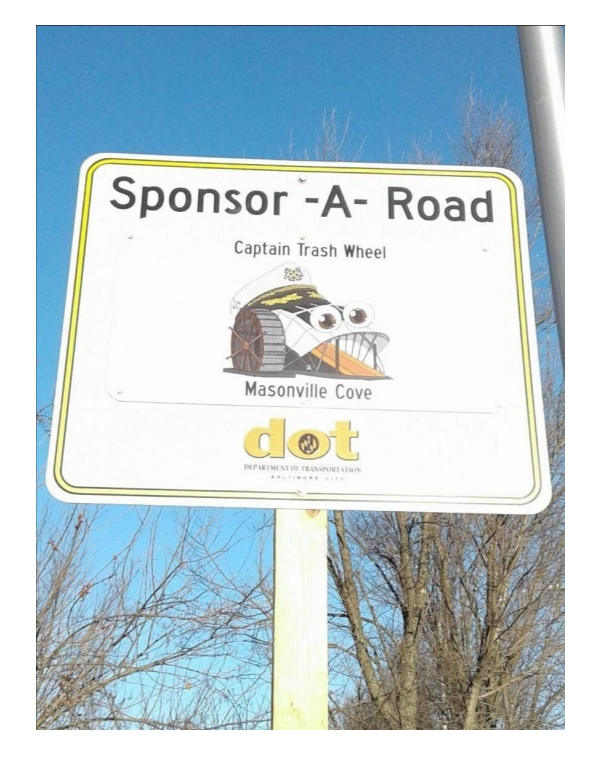
As part of the program, five signs listing Masonville Cove with the partnership logo or the Captain Trash Wheel logo have been installed in neighboring communities.