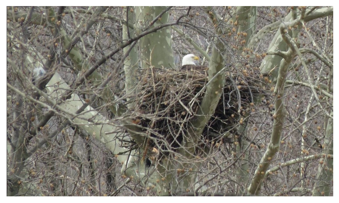
A photo taken in 2019 of the nesting bald eagles at Masonville Cove.

Partners at Masonville Cove, which include <u>U.S. Fish and Wildlife</u> Service, <u>Maryland Environmental Service</u> (MES), MDOT MPA, the <u>Living Classrooms Foundation</u>, and <u>National Aquarium</u>, will ensure disturbance to the eagles is minimized during this time and establish a protected area in compliance with National Bald Eagle Nest Protection Guidelines.