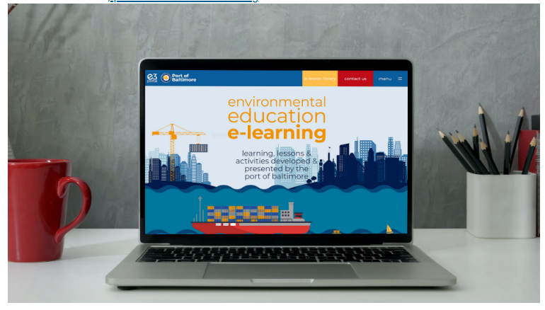
Photo: Originally created in response to meet the challenges of virtual learning during the pandemic, the "E3" portal will continue as a valuable resource.

While the Team is excited to resume in-person education safely, the E3 Portal will continue to exist as an additional resource with new features being added throughout the year. Check out the site at its new official web address, portofbaltimoreeducation.org.