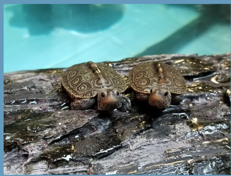
Photo: The Port of Baltimore TERP headstart program gives terrapin hatchlings a better chance of survival and teaches Maryland school children how to be community scientists.