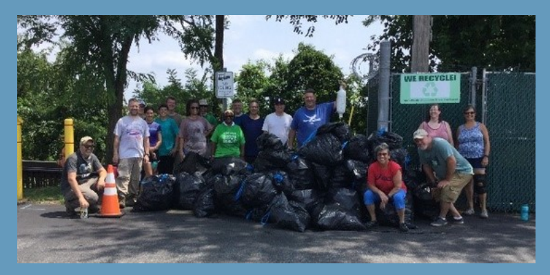
Photo: Geocachers, MDOT MPA, and MES volunteers participate in a successful cleanup at Masonville Cove. As stewards of the environment, geocachers take pride in helping to care for their cache host sites. Photo Credit: MES/Olivia Gulledge

"Caches at other Port facilities include a geocache at Hart Miller Island Beach and an EarthCache at Poplar Island," noted MDOT MPA geocacher DredgeQueen.