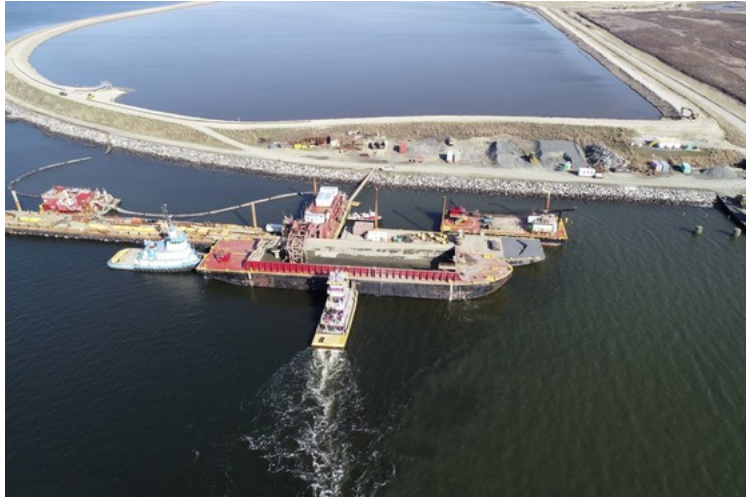
Photo: It's been 23 years since Poplar Island's first containment cell was completed, and in 2017 construction of the expansion began. The agencies are advancing plans for their next partnership using dredged materials to preserve and protect Maryland's waterways: the Mid-Chesapeake Bay Island Ecosystem Restoration.

For fiscal year 2021, the USACE's Baltimore District has been allocated $382,000 in its Corps of Engineers Work Plan to work with MDOT MPA on pre-construction engineering and design for the Mid-Chesapeake Bay Island Project . The project will rebuild two barrier islands – James and Barren – creating new habitat and providing much-needed shoreline protection in Dorchester County. The larger of the two, James Island, will have 2,072 acres restored, with 55% preserved as wetlands habitat and 45% as upland habitat. At Barren Island, 72 acres will be restored as wetlands.