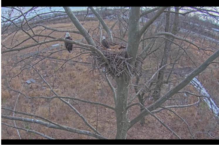
Photos: During the previous two seasons, the only known breeding pair of eagles within Baltimore City successfully raised four eaglets at their Masonville Cove nest.

Tune into this recent news segment from WJZ-TV , and consider visiting in person. The Captain Trash Wheel trail is still open and offers great views. You can also bring a child to take the Masonville Cove Book Walk! Visit the Little Free Library and help yourself to a free book. Practice social distancing and wear a mask when near other visitors. Partners include MDOT MPA, USFWS, Maryland Environmental Service (MES) , the Living Classrooms Foundation (LCF) , and the National Aquarium .