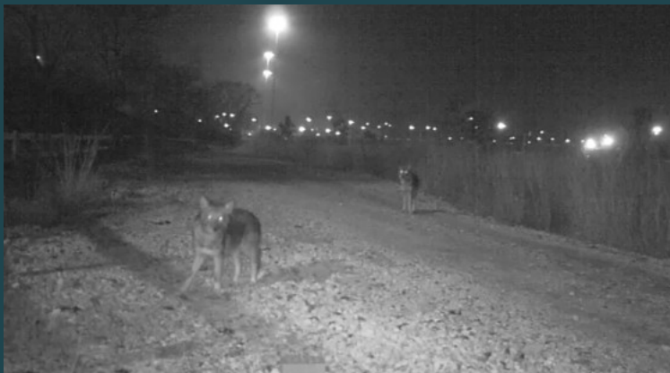
Photo: A coyote pair walks along the path at Masonville Cove.

According to the Maryland Department of Natural Resources , coyotes were first documented in Maryland in 1972. Maryland and Delaware are the last two states in the contiguous United States to be colonized by coyotes.