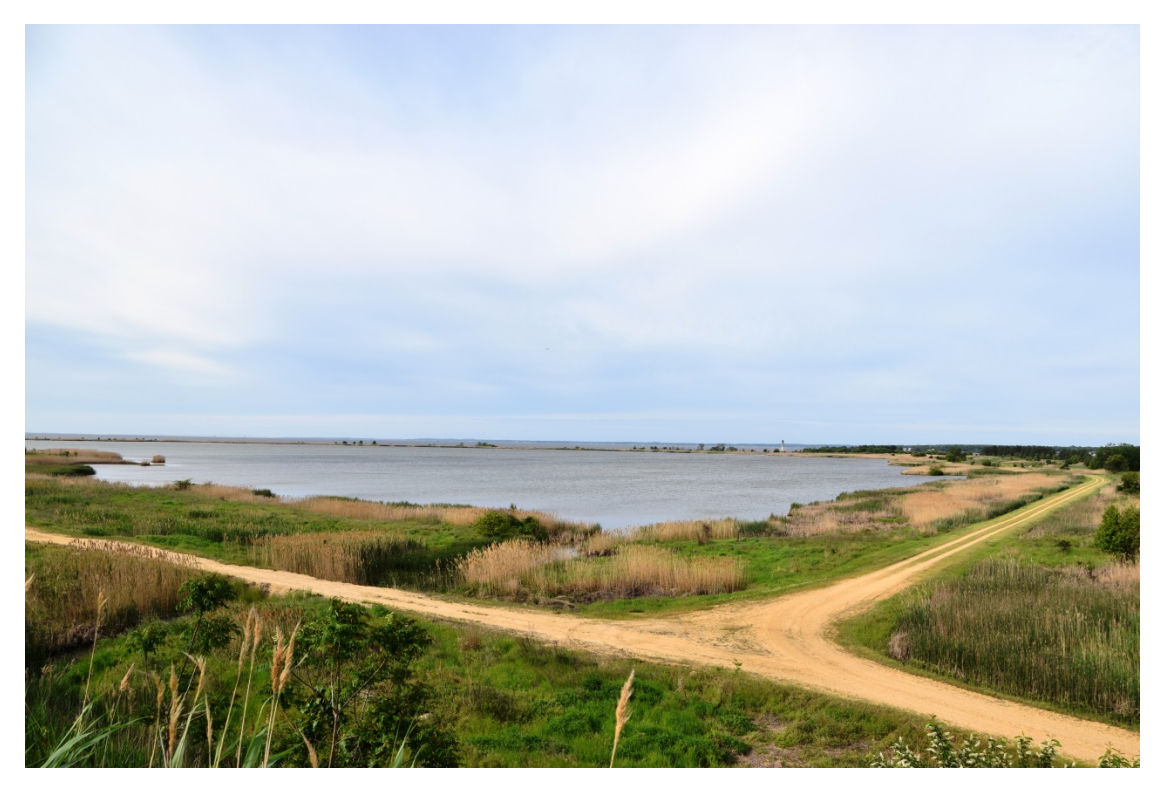
South Cell, looking south