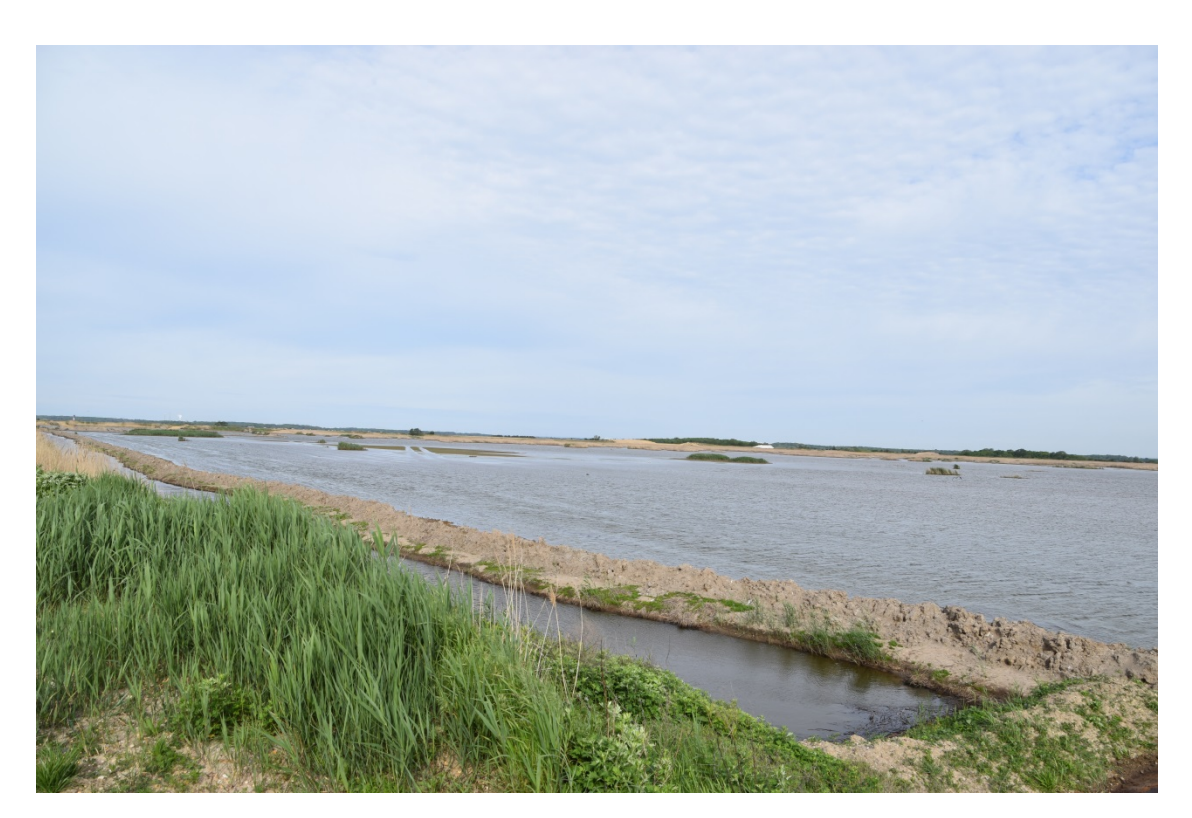
Spillway 009, looking southwest