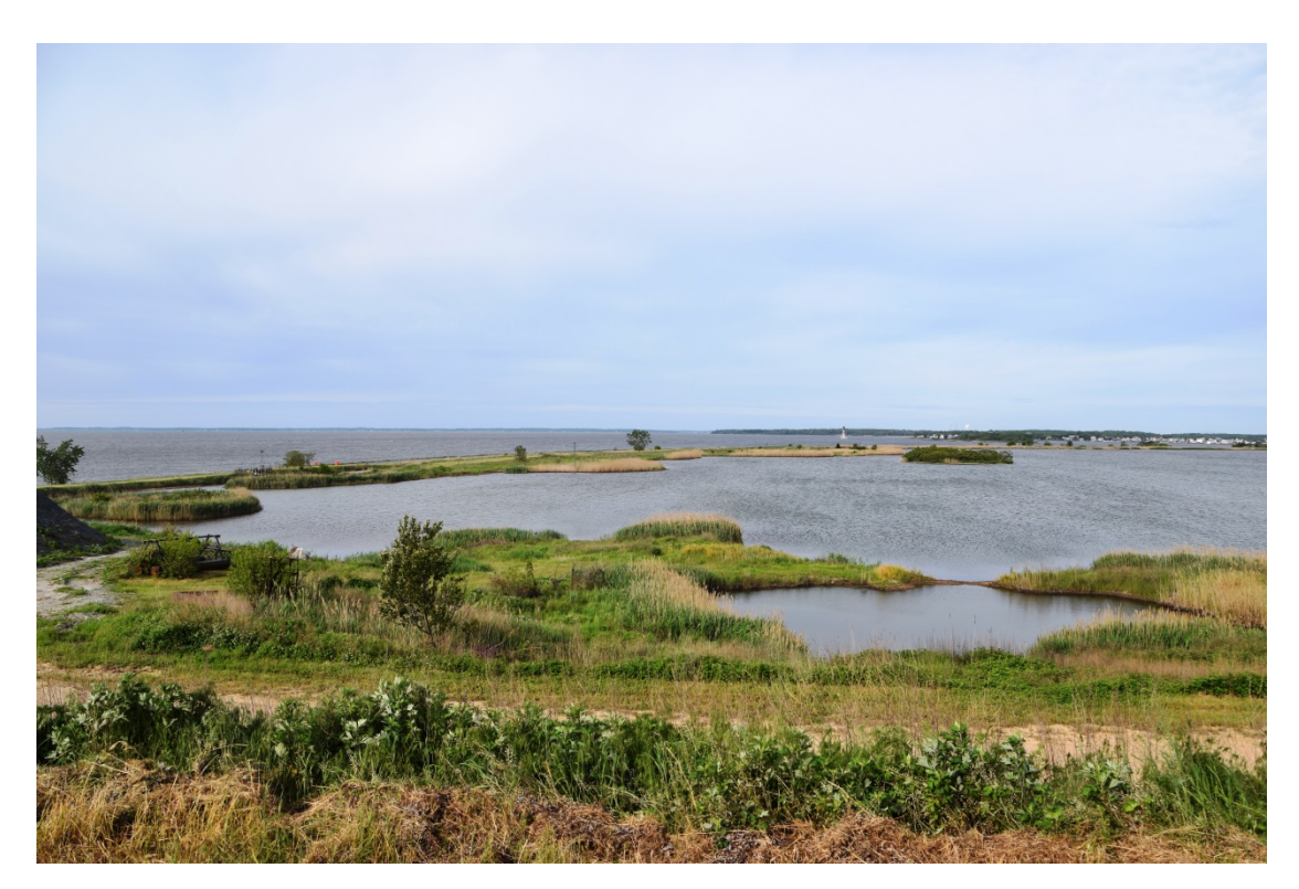
South Cell, looking southwest