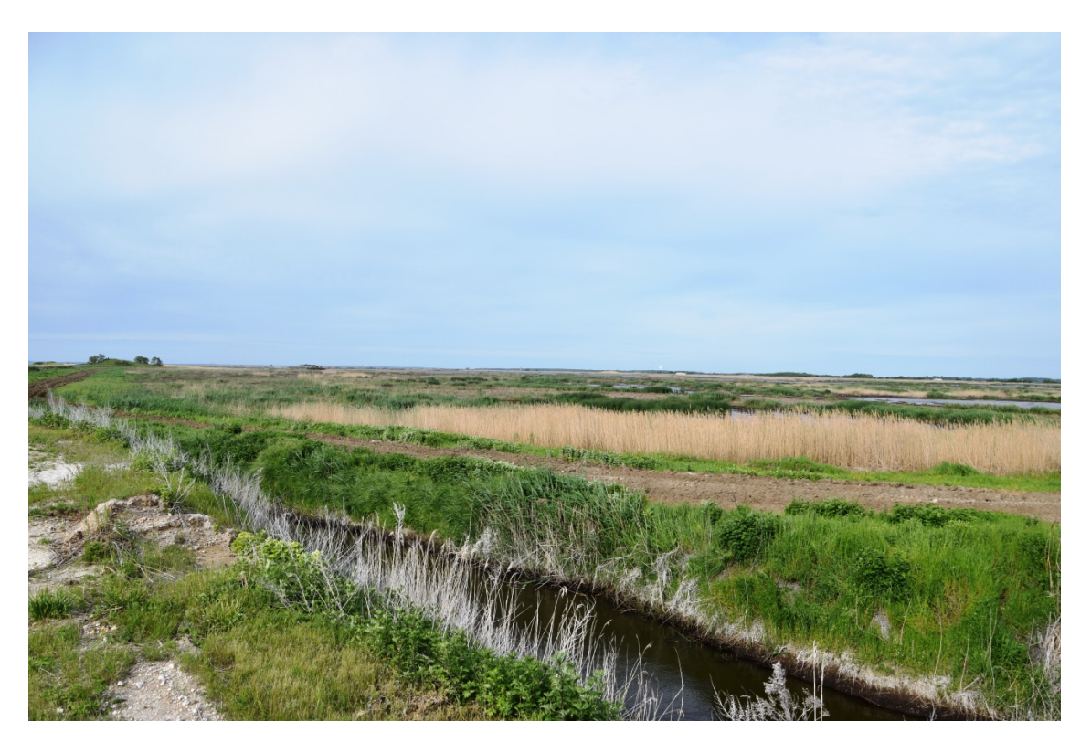
Spillway 007, looking west