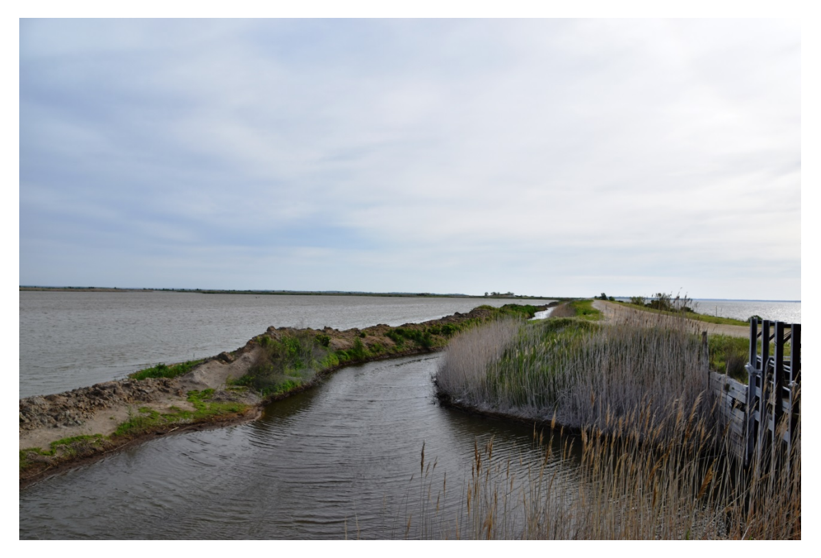
Spillway 009, looking northeast