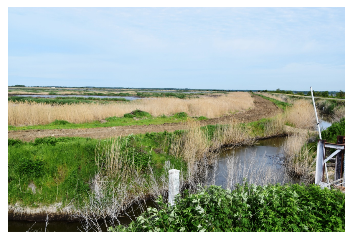
Spillway 007, looking east