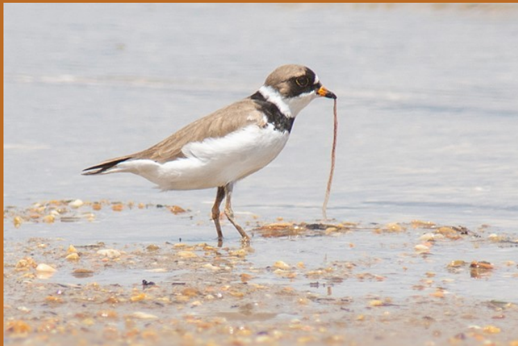
Photo: Sarbanes' favorite bird of the day was this semipalmated plover at Masonville Cove.