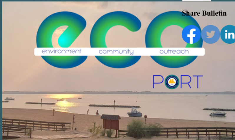
Hart Miller Island beach at sunset.