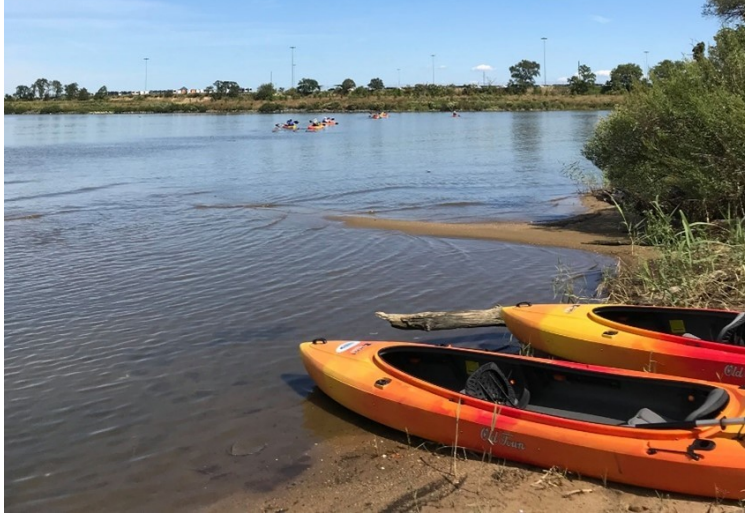
Photo: The Masonville Cove partnership provided outdoor games and family-friendly activities during the Urban Wildlife Conservation celebration, September 25-26, 2021. Forty-one people participated in free, guided kayaking for beginners for ages 16 and up.