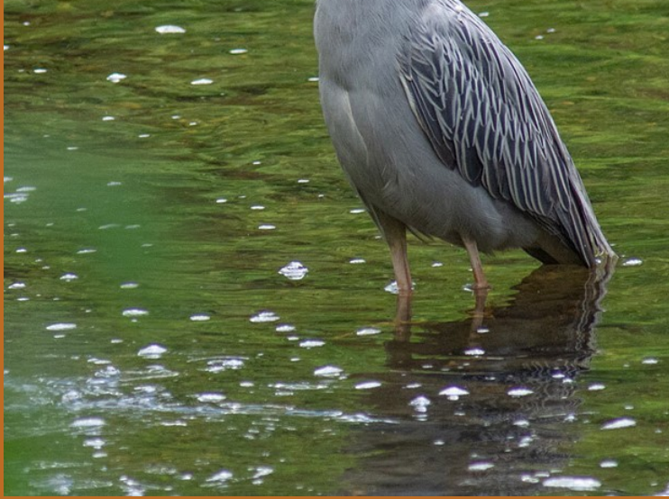
Photo: Yellow-crowned night-heron along the Gwynns Falls in West Baltimore.