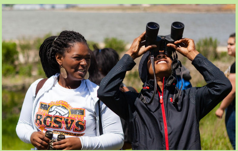
Chesapeake Bay Program