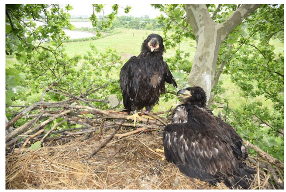
Eaglets at Masonville Cove

Today, Masonville serves an important role in education, community engagement, and outdoor recreation. Visit www.masonvillecove.org for hours of operation.