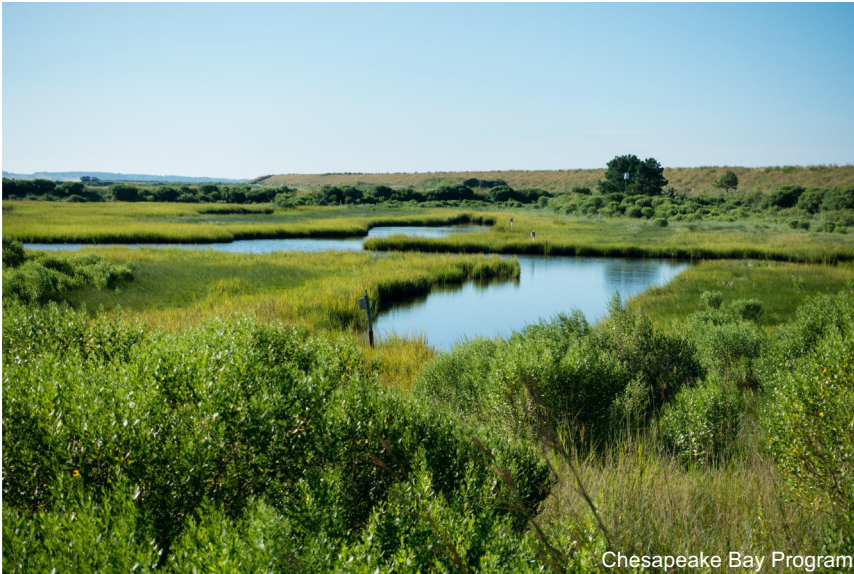
Chesapeake Bay Program

The Paul S. Sarbanes Ecosystem Restoration Project at Poplar Island (Poplar Island) is an international model for the beneficial use of dredged material located in the mid-Chesapeake Bay. The US Army Corps of Engineers and MDOT MPA began the project to restore Poplar Island in the 1990s. In 1996, only five acres remained of the 1,140 acres that were documented in 1847. About 100 residents called the Poplar Island town of Valliant home in the 1800s. By the 1920s, all of the residents had left due to erosion. The island then became a hunting retreat that welcomed both President Franklin D. Roosevelt and President Harry S. Truman.