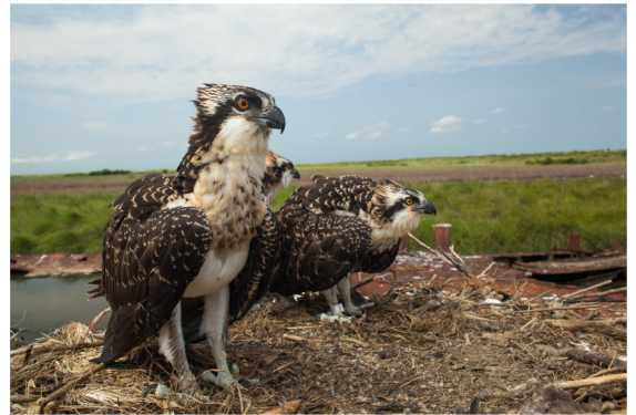
Chesapeake Bay Program

Since monitoring began, more than 240 species of birds have been observed. Year after year, wildlife including the diamondback terrapin and many species of birds including the common tern (recently State listed as Endangered) return to the island for vital nesting habitat.