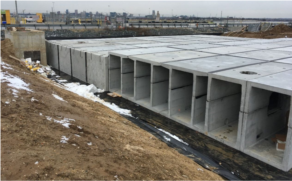
This sand filter at the Fairfield Marine Terminal will trap sediments and pollution from stormwater runoff before it flows into the Patapsco River.