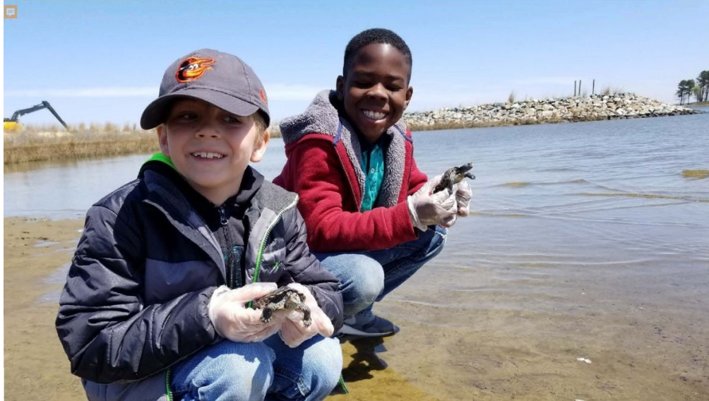
MDOT MPA and partners help students learn more about the environment firsthand and foster a lifelong love of nature.