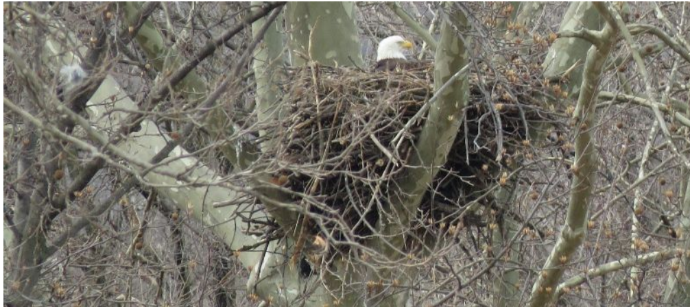
Nesting bald eagles make their home at Masonville. Since 2007, 230 bird species have been recorded at Masonville, making it No. 3 on the Baltimore eBird list of hot spots.

Access to the property will be limited during breeding season to a small area east of the education center. Events scheduled inside the education center will not be impacted, but some other onsite activities will be limited or suspended during breeding season.