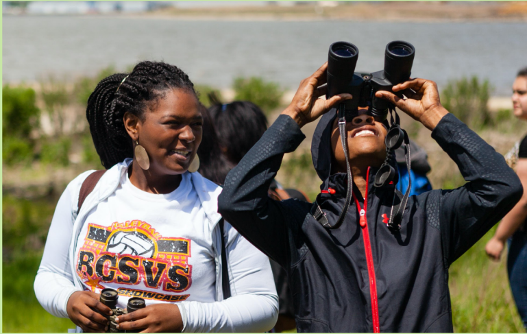
Chesapeake Bay Program