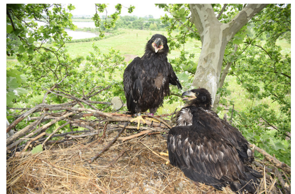
Eaglets at Masonville Cove

"I [liked] learning about the animals and trees that are found at Masonville Cove."