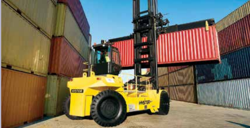
UPGRADES TO CARGO HANDLING EQUIPMENT AND HEAVY-DUTY DIESEL VEHICLES HAVE HELPED TO LOWER EMISSIONS EVEN AS THE PORT'S CARGO NUMBERS HAVE STEADILY INCREASED.