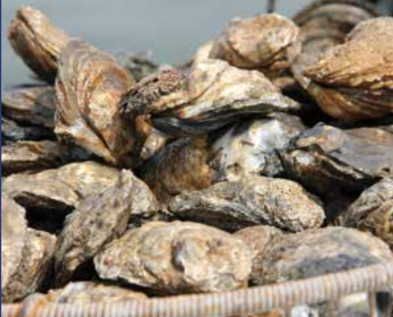
OYSTERS ARE THE CHESAPEAKE'S NATURAL FILTER.