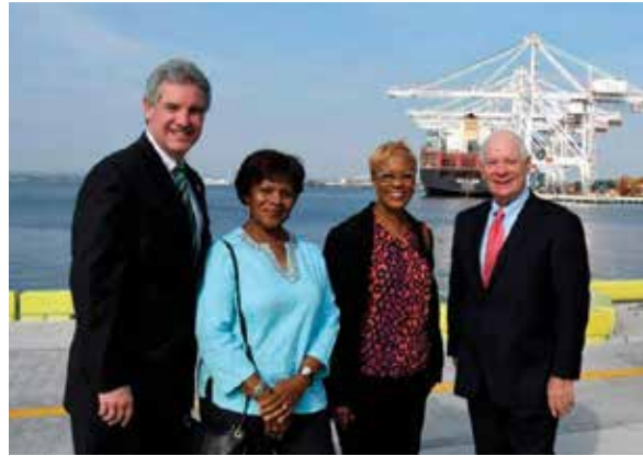
OFFICIALS AND COMMUNITY MEMBERS CELEBRATED A $1 MILLION GRANT TO REDUCE EMISSIONS FROM PORT-RELATED EQUIPMENT. PICTURED HERE (LEFT TO RIGHT) ARE SHAWN M. GARVIN, FORMER ADMINISTRATOR FOR THE U.S. EPA MID-ATLANTIC REGION; EDIE BROOKS AND GLORIA NELSON OF THE TURNER STATION CONSERVATION TEAMS; AND U.S. SENATOR BEN CARDIN.