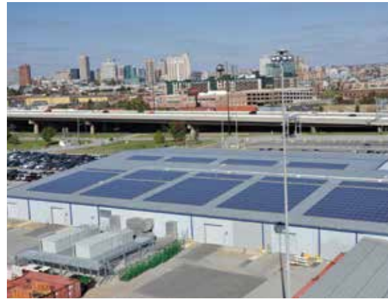
ROOFTOP SOLAR SYSTEMS AT THE CRUISE TERMINAL AND SOUTH LOCUST POINT MARINE TERMINAL GENERATED 805,000 KWH.

To fulfill its mission, the MDOT MPA must operate along the water's edge, making it vulnerable to the impacts of climate change, including sea level rise, extreme weather conditions and flooding. The MDOT MPA is doing its part to mitigate these impacts by reducing its greenhouse gas emissions and building resiliency into its facilities.