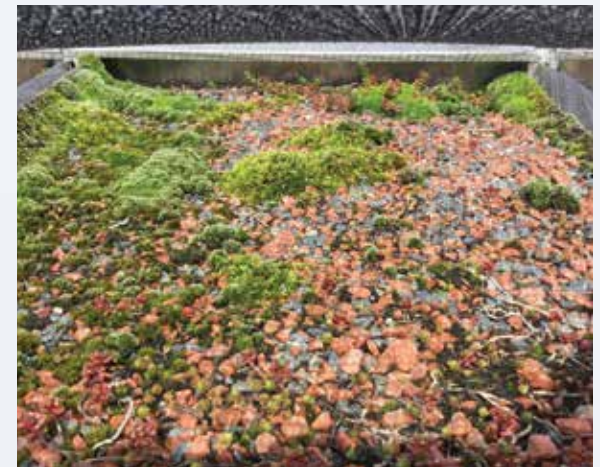
THE PORT'S GREEN ROOF GREET'S SPRING AND EMERGES FROM WINTER'S DORMANCY.