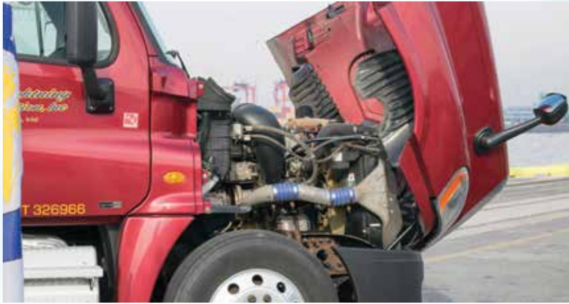
NEW DRAY TRUCK WITH CLEANER DIESEL ENGINE.