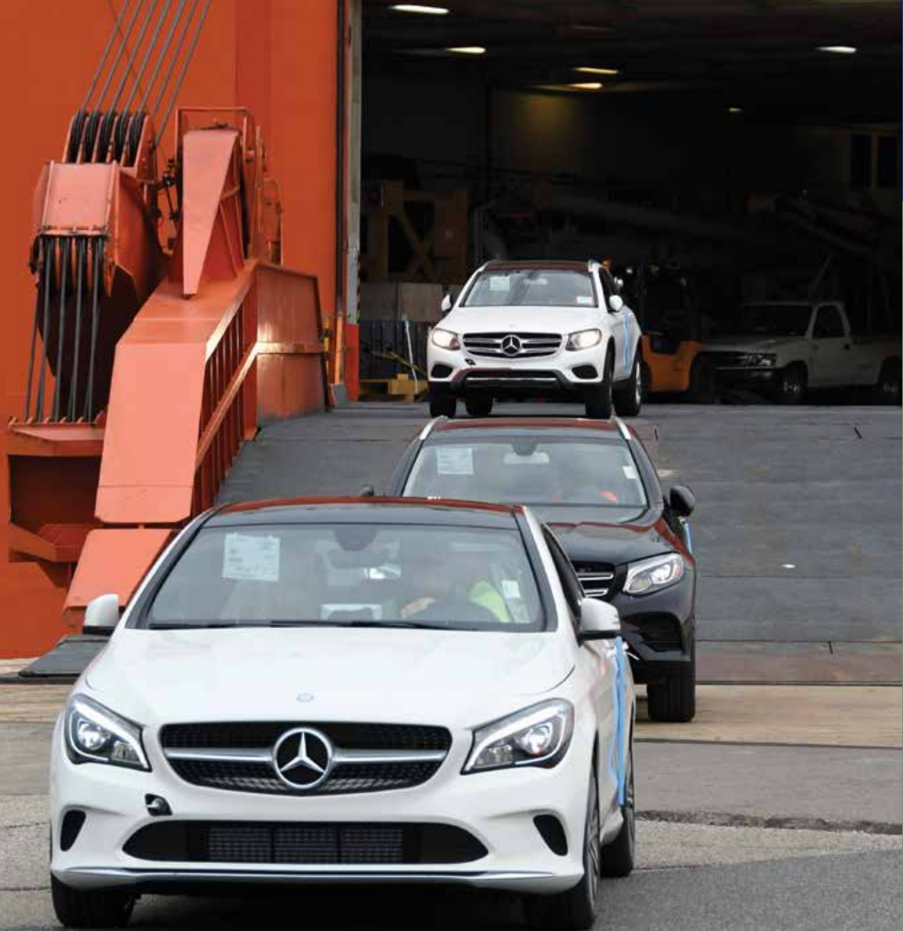
IN 2017, THE PORT RANKED FIRST IN AUTOS AND LIGHT TRUCKS IN THE UNITED STATES FOR THE SEVENTH STRAIGHT YEAR.