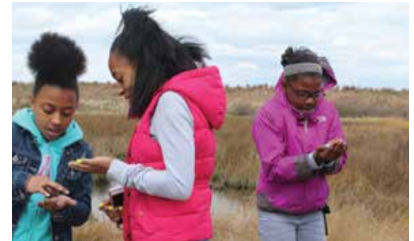
STUDENTS VISIT THE PAUL S. SARBANES ECOSYSTEM RESTORATION PROJECT AT POPLAR ISLAND.

The MDOT MPA is devoted to building strong relationships with the people living in nearby neighborhoods. Along with its private sector partners, the MDOT MPA helps organize and participate in cleanups and other community enhancement activities throughout the Baltimore area. The MDOT MPA attends many community association meetings and events throughout the year to build an understanding of the challenges facing the neighborhoods surrounding the Port, increase citizens' awareness of Port-related matters, and seek mutually beneficial solutions to common challenges. Many private citizens and advocates give time and energy to committees that are set up to advise the MDOT MPA on dredging matters including the Harbor Team, Citizen Advisory Committee, and the Management Committee.