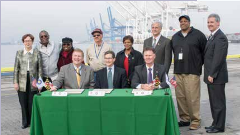
ALL STAKEHOLDERS PARTICIPATED IN THE SIGNING OF THE MARYLAND INTER-AGENCY VOLUNTARY AGREEMENT IN 2015.

By continually upgrading cargo handling equipment and heavy-duty diesel vehicles and adopting state-of-the-art operational technologies, the Port has ensured that emissions have dropped even as the Port's cargo numbers have steadily increased.