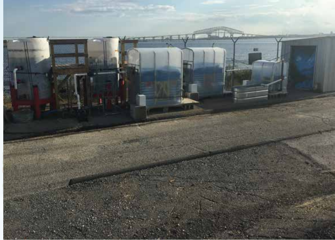
THIS DIGESTER IS TURNING ALGAE INTO FUEL.

Older trucks, locomotives, and other cargo-handling equipment have been upgraded or replaced with newer, cleaner burning engines or emission reduction technologies by the MDOT MPA and its partners. Grants from the U.S. Environmental Protection Agency and the Maryland Department of the Environment helped replace 172 dray trucks and install idle reduction technology on locomotives. Twenty-six forklifts, yard tractors and similar equipment used to handle cargo have been replaced or upgraded.