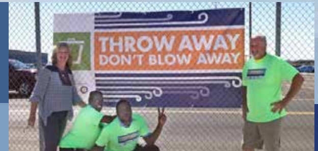
THE 'THROW AWAY DON'T BLOW AWAY' LITTER REDUCTION CAMPAIGN IS A PARTNERSHIP BETWEEN WALLENIUS WILHELMSEN SOLUTIONS AND THE MDOT MPA AT THE DUNDALK MARINE TERMINAL.