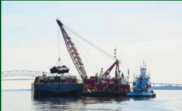
DREDGING IS A CRITICAL COMPONENT TO THE PORT OF BALTIMORE'S SUCCESS.

Approximately 150 nautical miles of shipping channels run through the Chesapeake Bay to Baltimore Harbor. An average of more than 4.7 million cubic yards of sediment is dredged from these channels annually to ensure safe passage for ships. The MDOT MPA manages the sediment dredged out of the channels in environmentally friendly ways by beneficially using it to restore wetlands, shorelines, and islands, reusing it in innovative ways as a raw material, and constructing containment facilities.