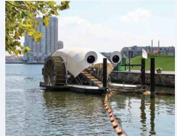
MR. TRASH WHEEL IN BALTIMORE'S INNER HARBOR.

The MDOT MPA operates an award-winning system that uses algae to remove nutrients and sediment, which have been identified as pollutants impairing the Chesapeake Bay. Water from the Patapsco River, which enters the Chesapeake Bay, is pumped from the river into a shallow 200-foot long flow-way where algae feeds on the nutrients. When the water is returned to the river, it not only has nutrients and sediment removed, it also has increased dissolved oxygen levels thereby improving water quality.