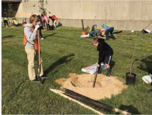
MDOT MPA AND MES EMPLOYEES JOIN MEMBERS OF THE COMMUNITY TO GIVE BACK, PLANTING TREES WITH BLUE WATER BALTIMORE.