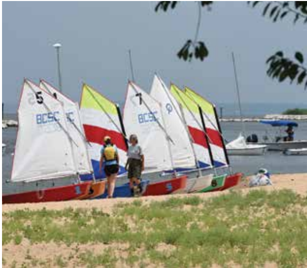
SAILORS PARTICIPATE IN A REGATTA AT HART-MILLER ISLAND.