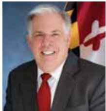
Larry Hogan Governor of Maryland

At the Maryland Department of Transportation Maryland Port Administration (MDOT MPA), we believe that taking responsibility for clean air, land, and water not only complements good business, but drives it. Through the MDOT MPA's GreenPort initiative, port leaders, employees, tenants, and community volunteers are working together to meet more stringent environmental standards and deliver excellent business results. From sound environmental practices and clean-diesel equipment to wildlife habitat and community greening, the MDOT MPA is actively pursuing its commitment to a thriving and sustainable port.