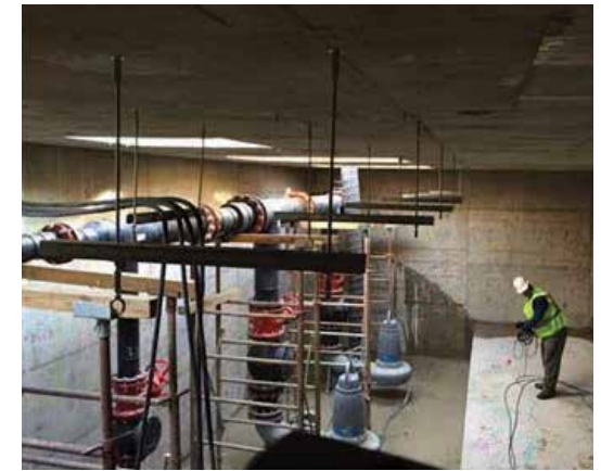
AN UNDERGROUND VAULT AT THE DUNDALK MARINE TERMINAL TREATS 10 ACRES OF IMPERVIOUS SURFACE.

The MDOT MPA entered into an energy performance contract with its utility provider to reduce energy consumption. As a result, facilities owned by the MDOT MPA showed a noticeable reduction in electricity consumption in FY-2016 (approximately 6 million kWh) when compared to baseline year 2008.