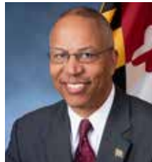
Boyd K. Rutherford Lieutenant Governor of Maryland