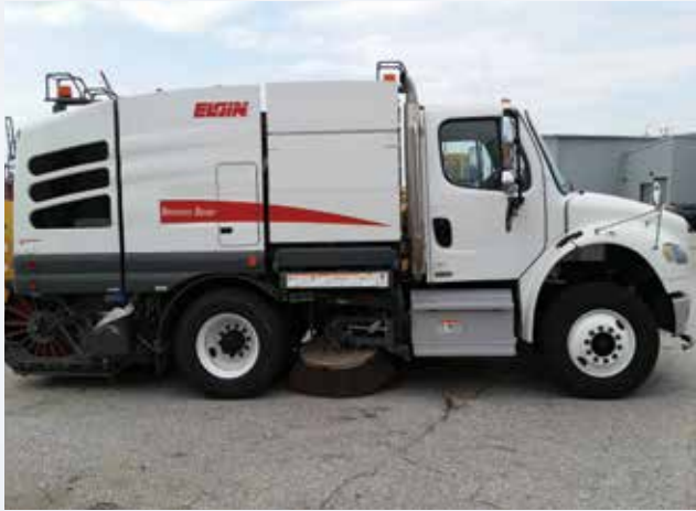
STREET SWEEPERS HELP KEEP SEDIMENT FROM REACHING THE PATAPSCO RIVER AND THE CHESAPEAKE BAY.