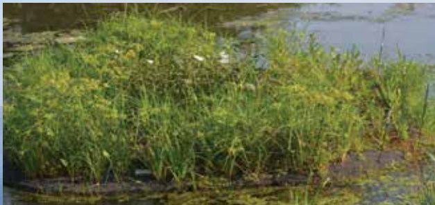
THE MDOT MPA HAS INSTALLED NUMEROUS "FLOATING WETLANDS," WHICH ARE RAFT-LIKE COLLECTIONS OF WETLAND PLANTS THAT DRAW A VARIETY OF FISH AND BENEFICIAL MICROSCOPIC CREATURES TO THEIR ROOT MASS.

The MDOT MPA, supported by a grant from the DNR, installed an innovative lightweight green roof on a building at the Dundalk Marine Terminal that could not support a traditional heavier green roof. This prototype is successfully growing vegetation that filters rainfall and reduces stormwater runoff.