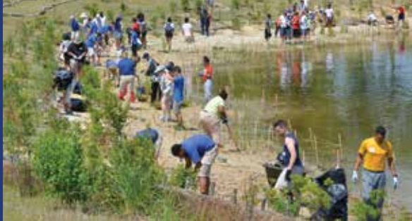
COMMUNITY CLEANUP AT MASONVILLE COVE