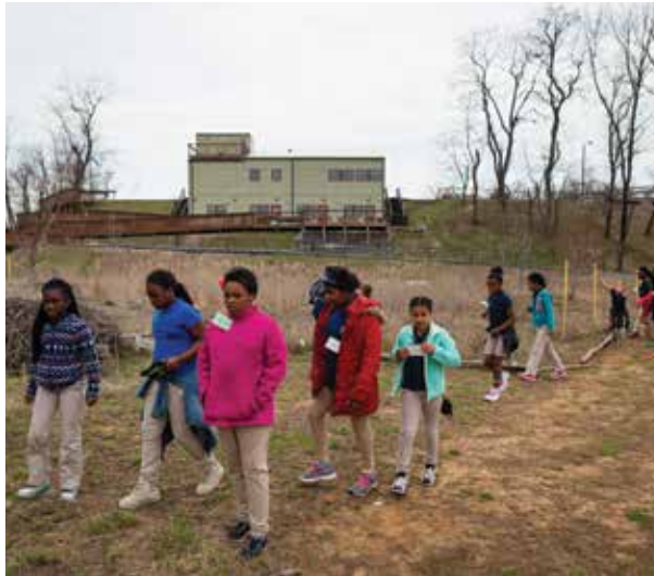
STUDENTS VISIT THE MASONVILLE COVE ENVIRONMENTAL EDUCATION CENTER.

Now home to a state park, a wide range of wildlife visits the island, such as songbirds, owls, heron, deer, foxes, and muskrat. The Maryland Ornithological Society has observed 285 species of birds there, including a large number of waterfowl and migratory birds – at times creating the largest single concentration of waterfowl in the mid-Atlantic region.