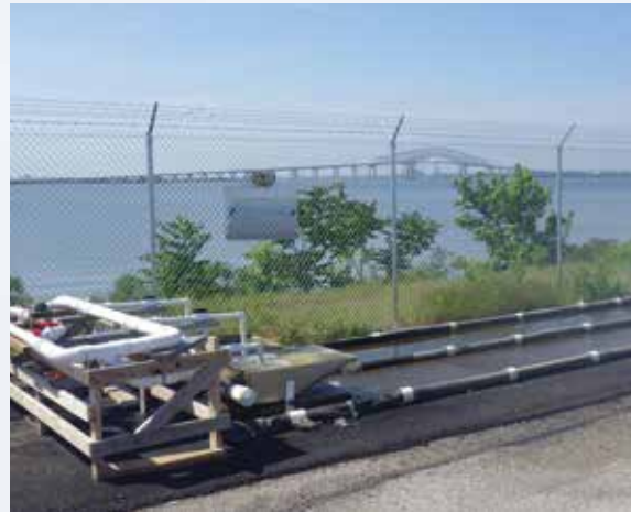
THE ALGAL FLOW-WAY AT THE DUNDALK MARINE TERMINAL HELPS REMOVE NUTRIENTS FROM THE RIVER.

Oysters remove pollutants from the water and create food and habitat for other creatures, but they have been drastically reduced by disease. To assist in their comeback, the MDOT MPA, the Maryland Department of Natural Resources (DNR), the Maryland Environmental Service, the Chesapeake Bay Foundation, and others worked together to help restore the oyster population. With funding from the MDOT MPA, the partnership created a 1-acre oyster reef with 3 million shells containing oyster larvae.