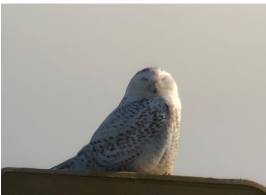
A snowy owl perched on Hart-Miller Island.

Approximately 40 enthusiastic birders participated in two "Snowy Owl Bus Tours" at Hart-Miller Island in January, led by the Maryland Environmental Service (MES).