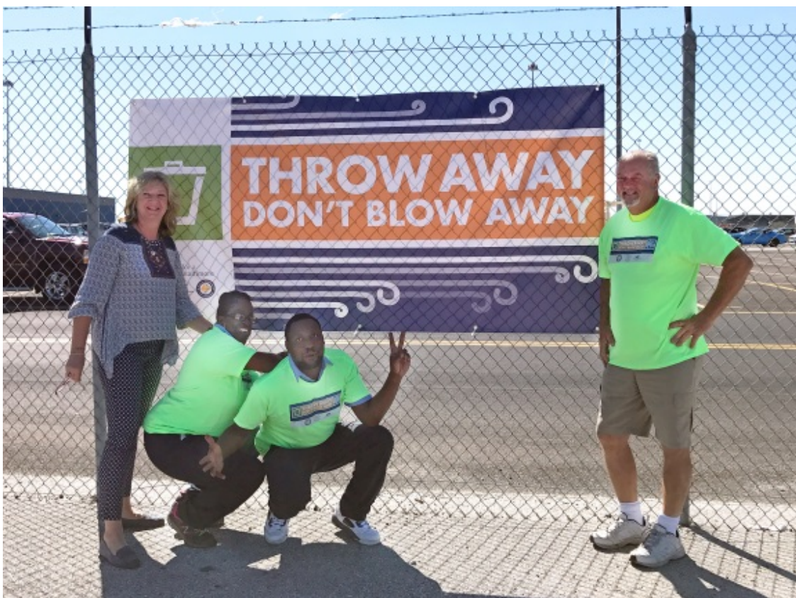
Volunteer Trash Ambassadors help spread enthusiasm for the anti-litter campaign.

To tackle this problem, the MDOT MPA, in partnership with Wallenius Wilhelmsen Logistics, recently kicked off a litter-reduction campaign at the Dundalk Marine Terminal.