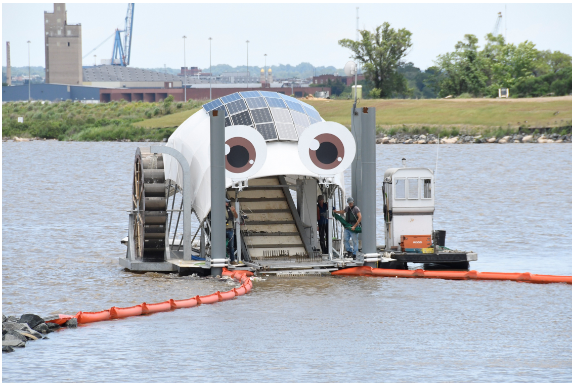
Captain Trash Wheel at the public unveiling on June 5, 2018.