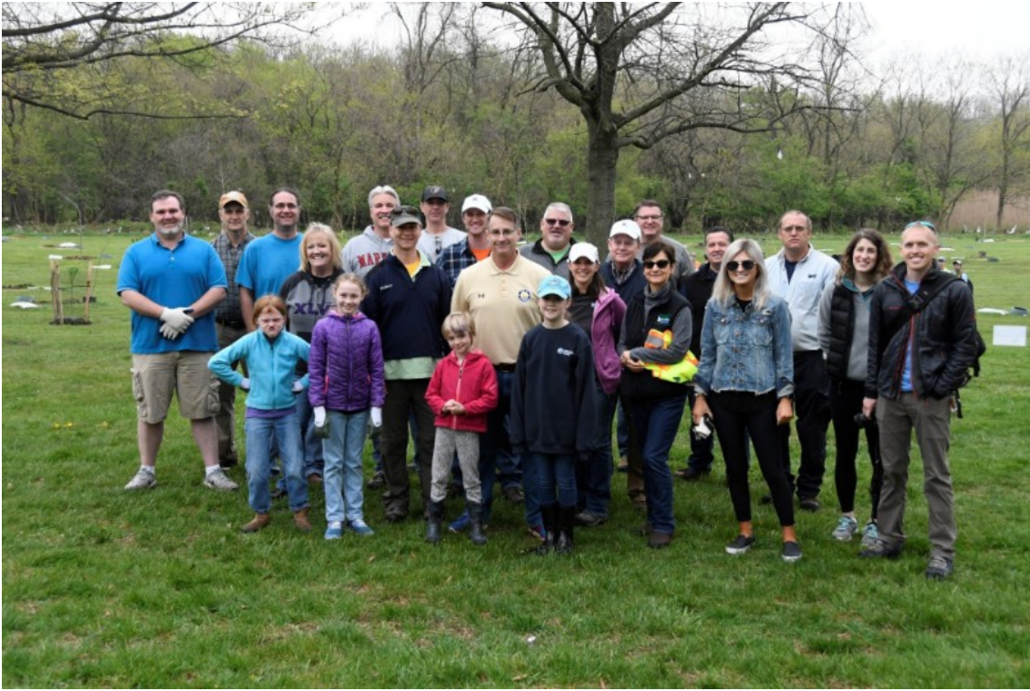
Port employees and their families pitch in to plant 150 new trees at Cherry Hill Homes.