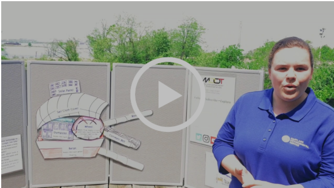
Watch this brief video highlighting the students' visit to Masonville Cove Environmental Education Center