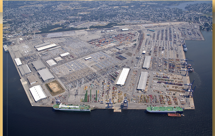
Dundalk Marine Terminal