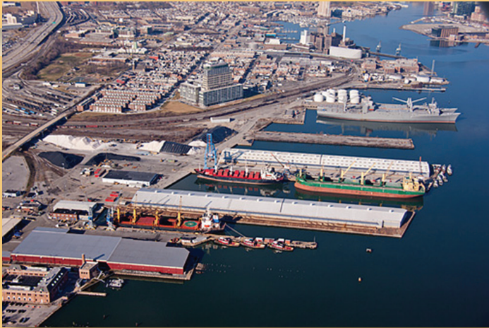
Locust Point North/South

We are experts in handling all types of bulk, breakbulk and project cargo.